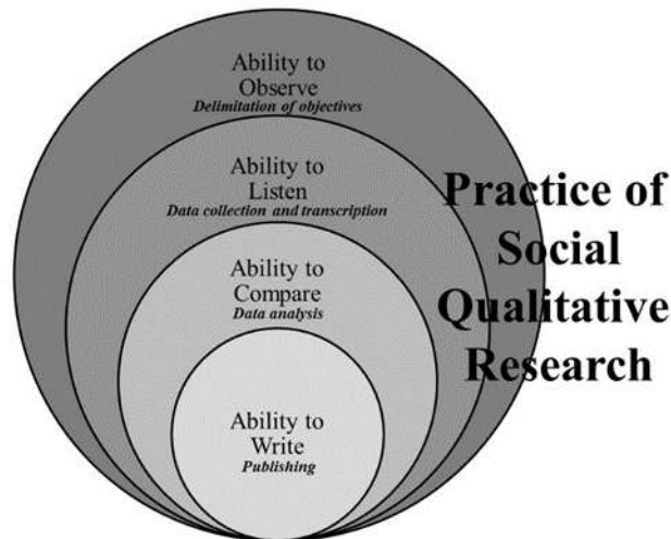
Figure 1 - Researcher procedural abilities for the life story